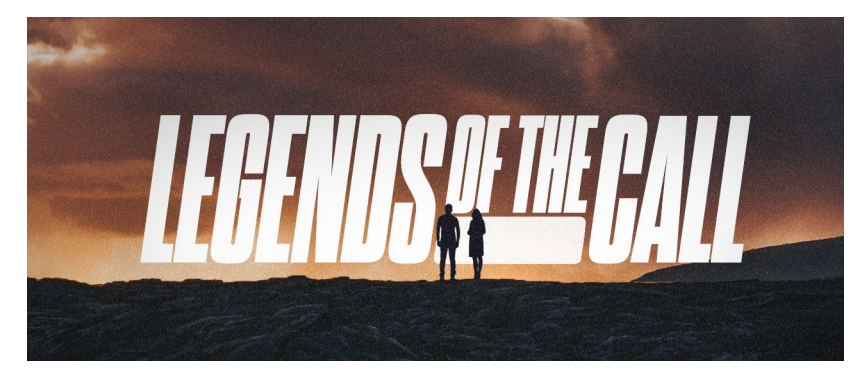
Total Devotion to God June 25 & 26, 2022

Am I completely devoted to God and His purposes for my life? Yes or No (Circle one)